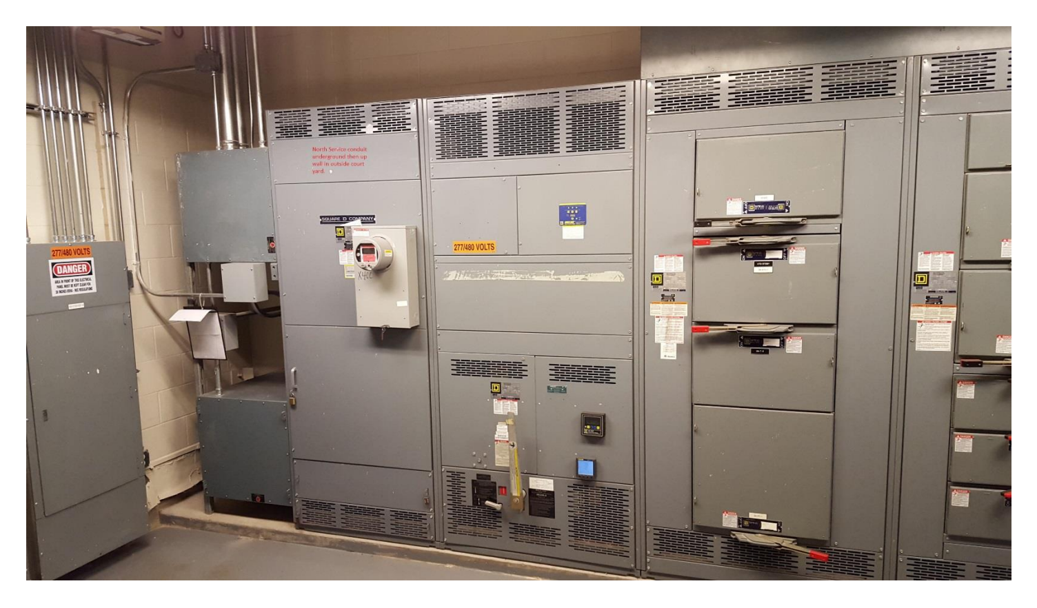
North tran gen – ADF 4