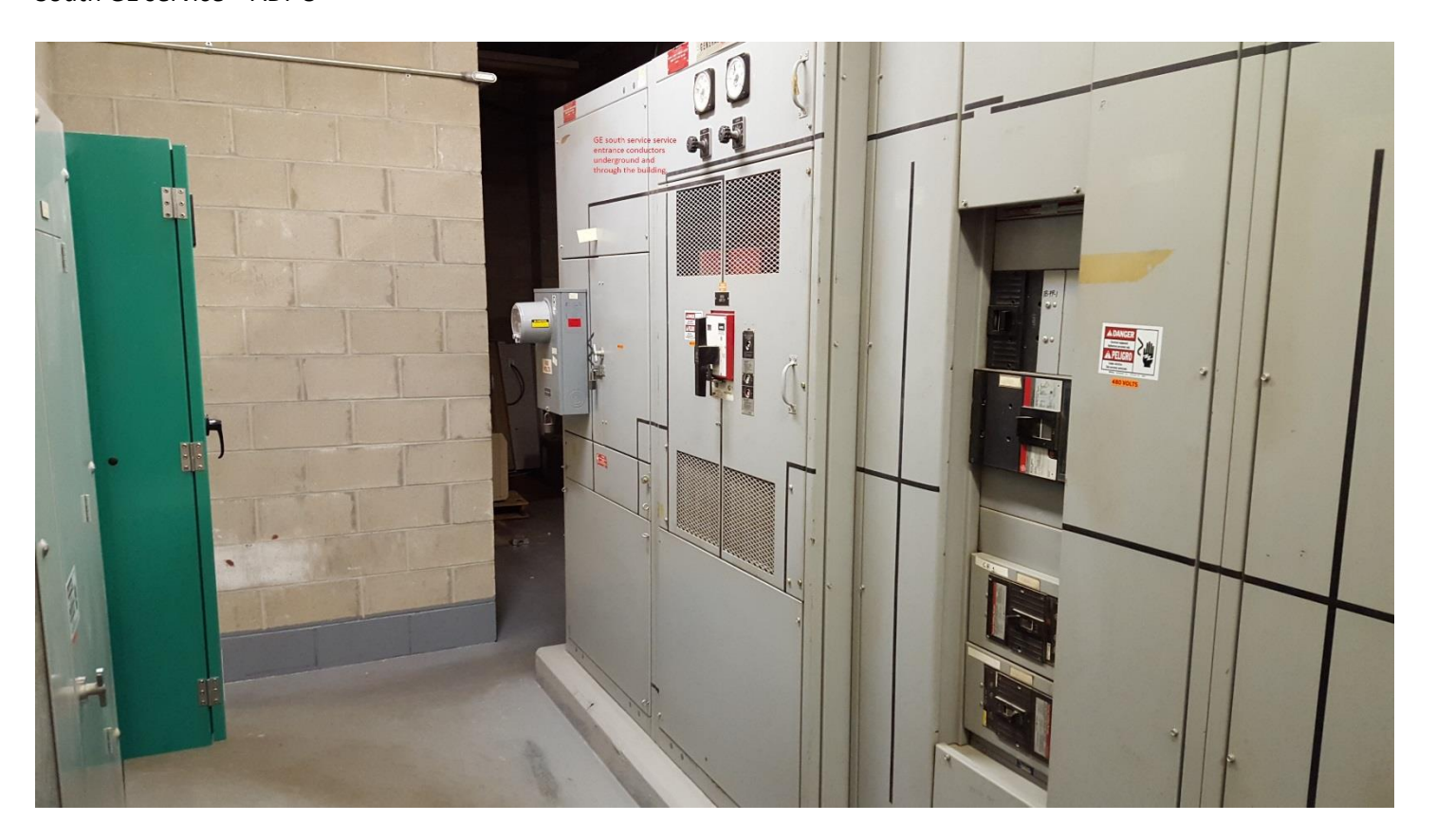
South tran gen – ADF 6